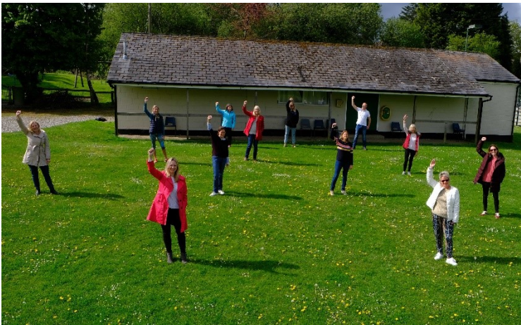
A cheery wave from the volunteers of Inkpen village

Take a look at our new look Hub website where you can sign up to our residents e-bulletin to receive regular service updates and download weekly updates about how the coronavirus pandemic is affecting West Berkshire and how the council is responding.